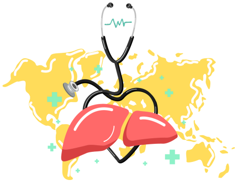
Chronic Hepatitis B & C